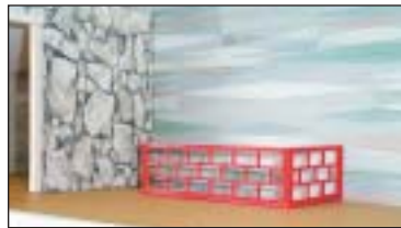
← Brio house with stone wall

ATTEMPTING TO IDENTIFY the dollhouses of the three major Swedish firms of the 1960s, Lundby, Brio, and Micki Gemla, can cause even the most zealous collector to fall into a quagmire of doubt. As soon as one is certain of a conclusion, then a twist appears that creates even more confusion—the fact that each company manufactured subtle variations of their houses. We must applaud the Home Swede Home exhibition at the Bethnal Green Museum of Childhood for tackling this question. To help set our readers' minds somewhat