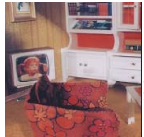
Pippi Longstocking TV set

The full range of items grew in pace with the increase in prosperity in Sweden and homes began to be filled with more and more acquisitions. The TV set with Pippi Longstocking or the playful kitten