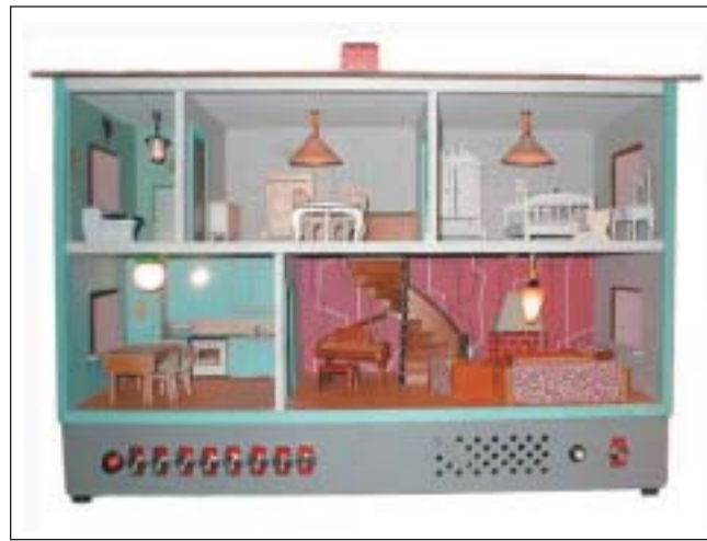
1950–60 Lundby house showing the grand piano. House wired by a third party.

Traditionally, the dollhouse had been a girl's toy, but during the seventies it became more common for boys to play with dollhouses; however, there were few of them who had their own houses, and