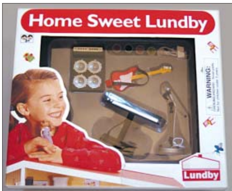
◀ Clockwise from the upper left: amplifier, disco lights, microphone, keyboard, and guitar (center). Popstars Instrument Set