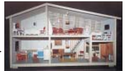
Lundby house with sunken room →