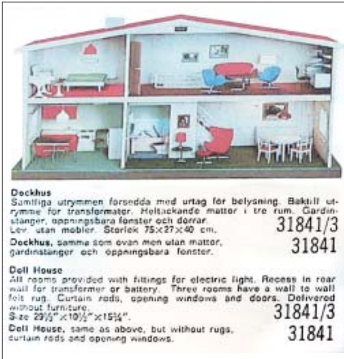
Page from a Brio catalog. Note the small label centered on the gable.