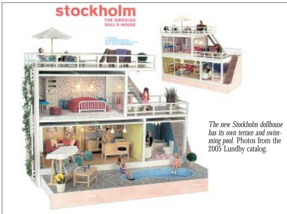
The new Stockholm dollhouse has its own terrace and swimming pool. Photos from the 2005 Lundby catalog.