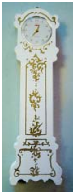
The Lundby Vision Clock

When Lundby of Sweden USA, Inc. was located in Chantilly, Virginia, I was fortunate to have received the Grandfather Clock as a gift from the firm. The little Clock stands 4.5" / 11.5cm x 2.5" / 5.7 cm at the base. The wooden body of the Clock is painted white with gold