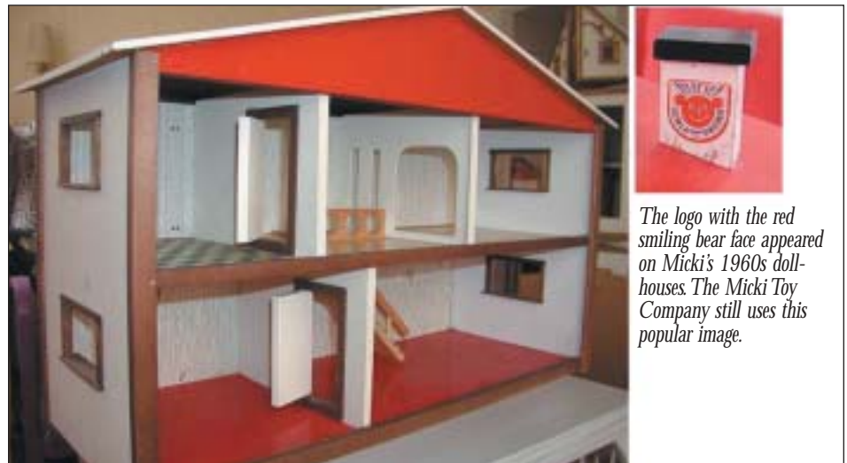
The logo with the red smiling bear face appeared on Micki's 1960s doll-houses. The Micki Toy Company still uses this popular image.

This Micki house featured a red wooden piece spanning the pitch of the roof to enable the cover to slide into place. Other design characteristics included the arched doorway and the wooden rail staircase leading to the second floor.