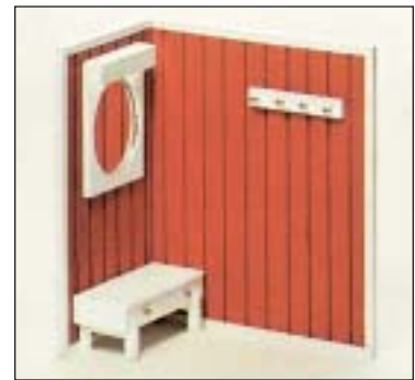
Photos from 1970 Lundby catalog.

The Sauna was also illustrated in Lundby catalogs of 1970/71. It was given as #8860. The Sauna, a steam room/cabinet for physical and mental relaxation, has had a long history with the Swedes and other Scandinavians. The miniature version proved to be both a profitable and an educational item in the Lundby line for a number of years.