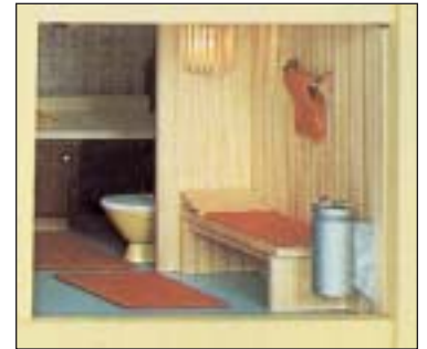
#8860 Sauna, with lamp.

A wooden bench and a decorative light fixture were attached to the shorter section of the Sauna. The longer section held the heater (with simulated coals) and a removable orange towel hanging on a rack. There was also a matching towel glued to the bench. The approximate dimensions of the Sauna were: height: 4 3/4"/11.9cm, length of longer section, 4"/10cm; length of shorter section, 1 1/2"/3.75cm; width, 1/4"/6.5mm. Birch or pine was used for the sections, and they were scored to represent paneling. The light was discontinued in 1974, and the other known variants include reverse placement of the shorter sections and color gradation of the towels.