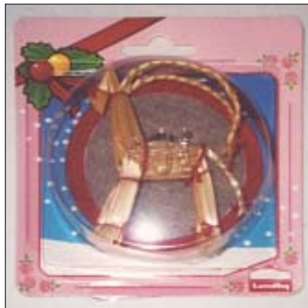
Lundby's version of the Christmas Goat.