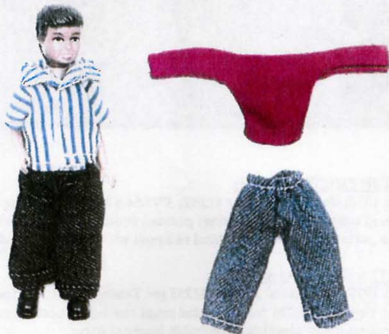
LUNDBY BOY WITH CLOTHES

Our first online Crafting with Lundby article continues the series on the Lundby Family. The SON from the Småland Family is pictured below.