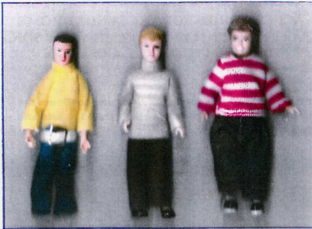
DOLLS FROM THE COLLECTION OF CAROLYN FRANK